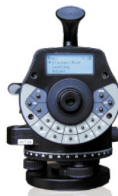
View Finder Side